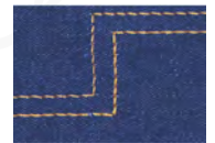
Stitch by split needle bar