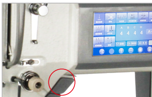
Can be set up to 9 sections differential mode