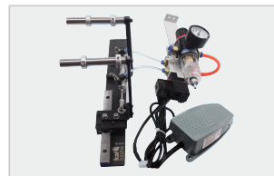
Extension roller stand (optional)