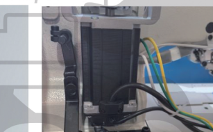
Stepping Motor Drive