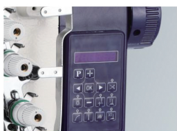
Integrated Mechatronic Design