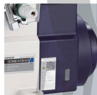
Direct-Drive Servo Motor