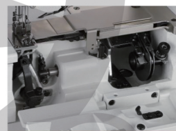
Optional External Thread Take-up Cam