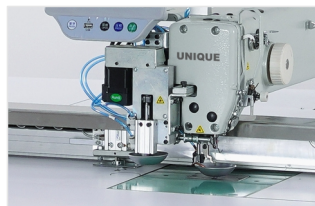
Knife cutting function