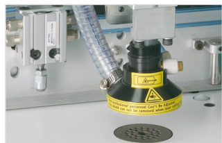
Laser cutting function