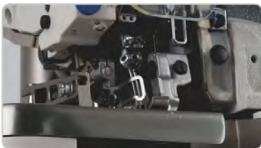
Intelligent fabric thickness sensor