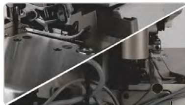
Automatic thread trimmer