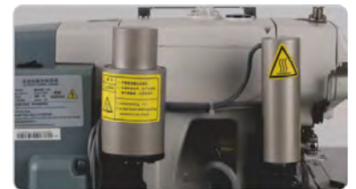
Automatic foot lifter device