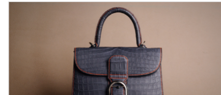
Bags and suitcases