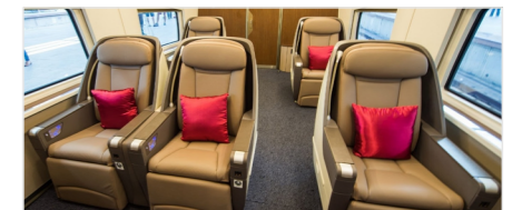
High speed rail interior