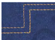
Stitch by split needle bar