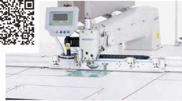
Laser cutter for pocket welting, pocket cover edge cutting and collar edge cutting.