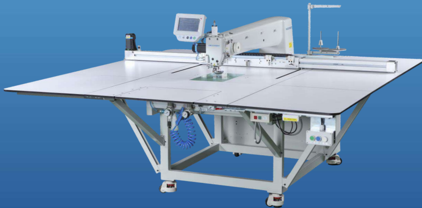
Table Size 2100X2193mm