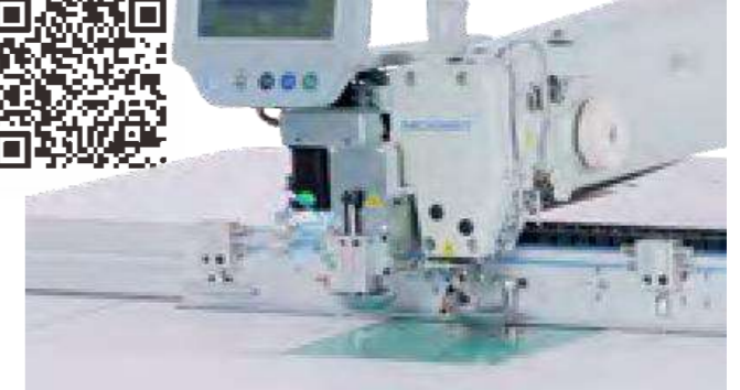
Blade cutter for cutting on fabrics with white or light colors