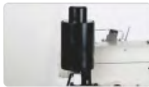
Automatic foot lifter device