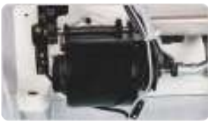
Automatic thread trimmer device